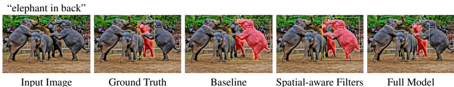
Figure 4: Sample results from different variants of the proposed model on RefCOCO.