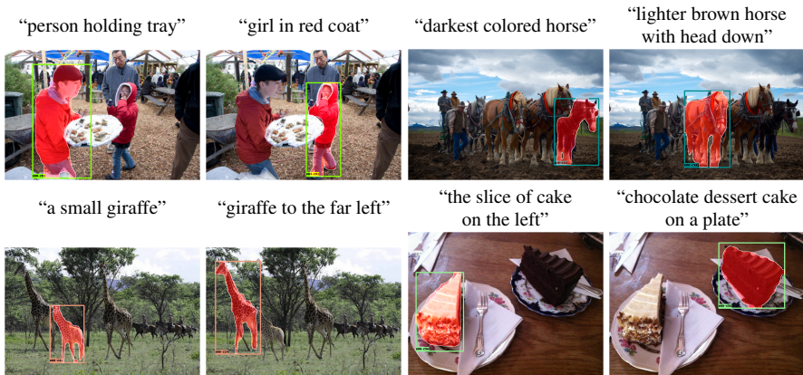
Figure 3: Sample results of objects referred by various query expressions.